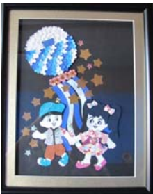
1st Place Award Plaque.

However, the Sky King allowed the lovers to meet once a year on 7/7. On 7/7, a flock of magpies link their wings together to form a bridge. The NYK kazari shows the two lovers on a bridge that is reminiscent of the Kintaiyo bridge in Yamaguchi.