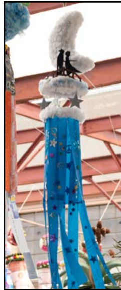
NYK's Winning Kazari.