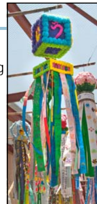
2014 NYK 4th Place Winner

Nanka Yamaguchi Kenjinkai will once again create an entry for the Tanabata Festival during the 2014 Nisei Week Festival taking place in Little Tokyo from August 9—17, 2014.